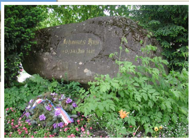
Place of Huss' Death, Constant