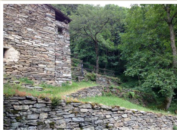
College of the Barbes, Pro del Torno