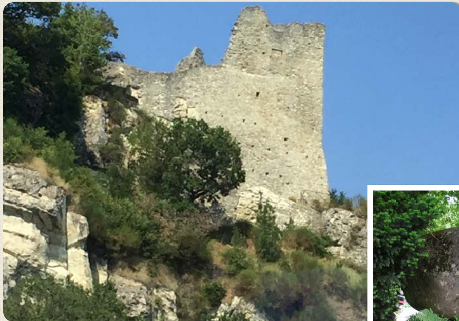
Castle of Canossa

RETRACE THE CHRISTIAN HERITAGE IN EUROPE FROM ITS ROOTS IN EARLY CHRISTIANITY, THROUGH THE DARK AGES, TO THE FRENCH REVOLUTION