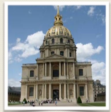
Napoleon's Tomb, Paris

Cancellation: In the event that a tour participant who has paid cannot go on the tour because of unforeseen circumstances, the following will apply: All cancellations are subject to a $50 administration fee, per person. Cancellations before January 15, 2018 will receive a full refund, less administration costs. Cancellations after January 15, 2018 forfeit the deposit; 45-30 days before the tour 50% of tour price; 29-0 days 100% of the tour price. It is therefore strongly recommended to have travel insurance to protect in case of any emergencies or valid, necessary cancellations. 100% of cancellation fees may be covered by the optional travel insurance protection plan (mentioned under the Travel Insurance section) provided premium has been paid and reasons for cancellation are insurable. Cancellations must be submitted in writing and dated. Depending on whether substitute persons can be found to fill the places or not, cancellation fees are sometimes waived by Christian Heritage Media. If the trip is cancelled due to political circumstances a full or partial refund, less administrative costs, will be issued.